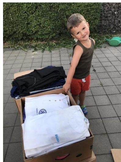
A young volunteer helps load the van.