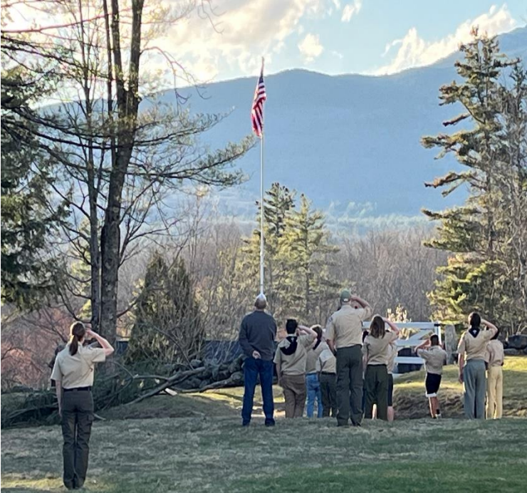
Scouts salute the flag ... and Mt. Monadnock.