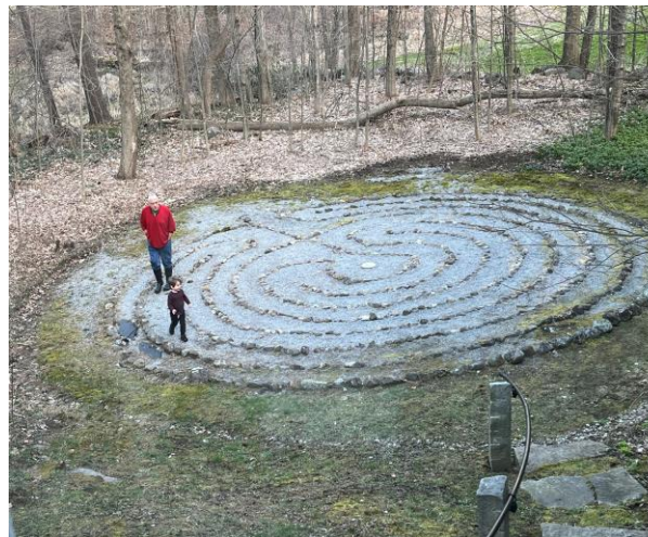
Reece and Pop walk the labyrinth

The labyrinth behind First Church has been cleaned up and welcomes visitors. What is a labyrinth? Here is one definition from the Healing Consciousness Foundation: “A labyrinth is an ancient symbol of wholeness. The imagery of the circle and spiral combine into a meandering but purposeful journey. The labyrinth represents a journey or path to our own center and back again out into the world.”